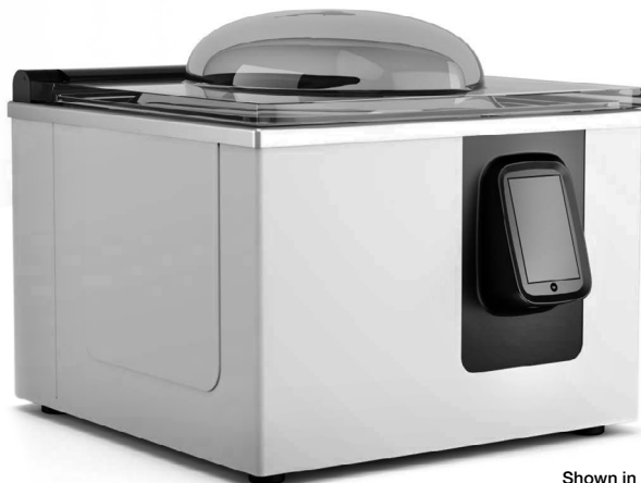
Shown in stainless